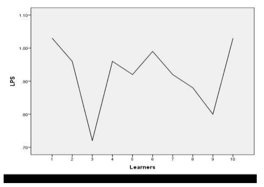
Figure 3. Different LPS Scores for Learners with the Same Actual Score of 66.75.

In order to answer this question, the researchers searched for learners with the most frequent actual score (mode) in the data file and then compared their learning potential score. The mode of actual scores was 66.75. In other words, 10 learners had the actual score of 66.75. Figure 3 shows the disparity of these learners in terms of their LPSs. It is clear that while these students are considered to be of the same level of PC, their varied LPS reveals that they might not be equal in terms of their abilities if their ZPDs are taken into consideration. That is, while two learners have LPSs as high as 1.03, there is another learner whose LPS is 0.72 which is considered as a low learning potential score.