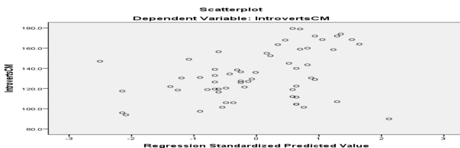
Figure 2. Plot of Studentized Residuals for Introverts’ CM

As for the second parameter – normality of the distributions – going back to Tables 1 and 2, the skewness ratios of both distributions fell within the acceptable range of \pm 1.96 ; hence, the distributions were normal. The remaining assumption which had to be checked was homoscedasticity, that is, the assumption that the variability in the introverts’ scores for the CM should be similar at all values of the scores on the AQP; to this end, the researchers examined the residuals plot (Figure 2).