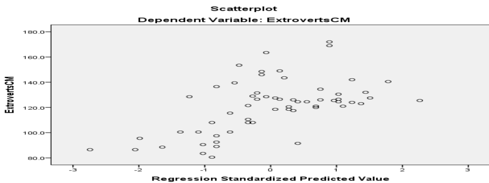
Figure 4. Plot of Studentized Residuals for Extroverts’ CM

Furthermore, as demonstrated in Tables 1 and 2, the skewness ratios of both distributions fell within the acceptable range of \pm 1.96 ; hence, the distributions were normal. Regarding the last parameter, as demonstrated in Figure 4, the cloud of data scattered shows evenness at both ends; thus the variance is homogeneous and the principle of homoscedasticity is met.