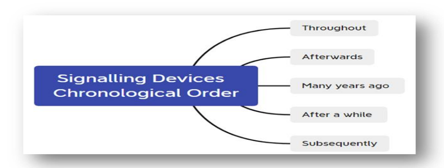
Figure 1 Sample Mind Map for Words That Signal Chronology

Guiding questions were also offered for each text structure to stimulate discussion on text structure and enhance textual awareness- raising. The teacher provided the students with instruction on how to summarize the texts with different tones of writing about their structures so that they could