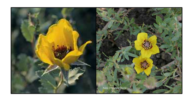
Fig. 1: Rosa persica produces solitary flowers with yellow petals and a red base.

Preservation of valuable germplasm is undoubtedly another important issue facing plant breeders, as the genetic relatedness of the current crop varieties is becoming higher than ever. This obviously requires preservation of plant genetic resources for their potential use in the future. Plant tissue culture methods are being extensively used in this area (Kazan, 2002). In general, growth and development of plantlets in vitro are faster and more uniform, plantlets in vitro have less physiological and morphological disorders, biological contamination in vitro is less, plantlets have a higher percentage of survival during acclimatization ex vitro. Hence, production costs could be reduced and plant quality could be improved significantly with photoautotrophic micropropagation (Kozai et al. , 2005).